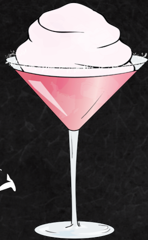
COTTON CANDY MARTINI

Vodka, cointreau, lime juice, raspberry cordial, lemon squash topped with cotton candy