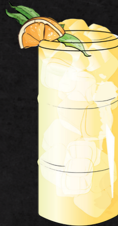
COCONUT TROPICAL BREEZE

Vodka, cointreau, lime juice, raspberry cordial, lemon squash topped with cotton candy