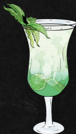
WILD MINT MOJITO

Peach vok, vodka, cranberry & orange juice with ice